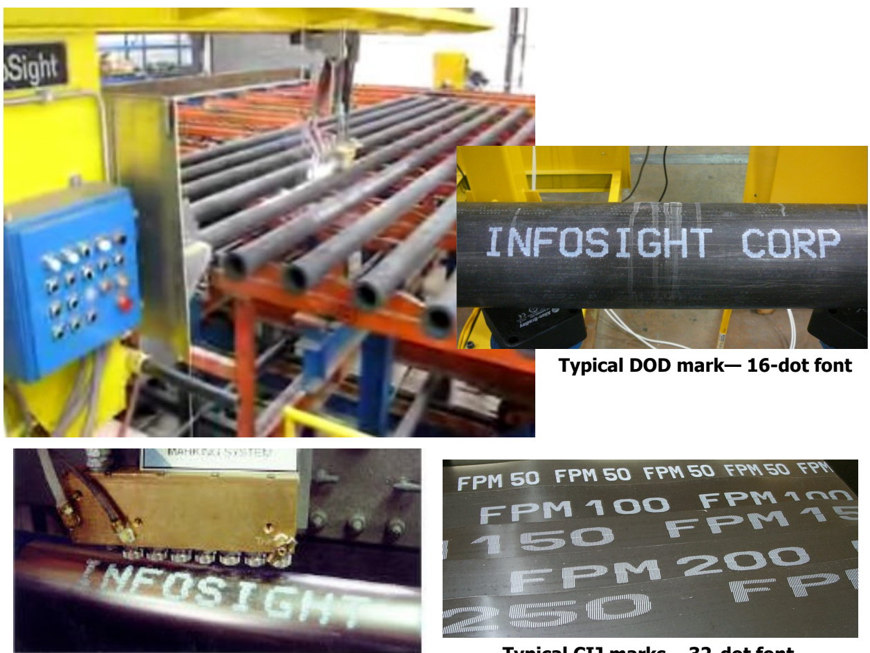
Typical I-DENT mark—5x7 font